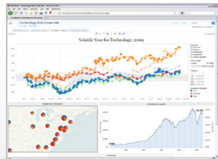
Tableau Server For Organizations

Tableau Software Serial Crack Keygen.rar