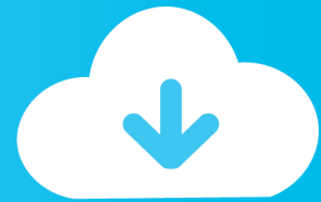
Tableau Software Serial Crack Keygen.rar